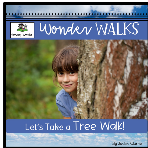
Let's Take a Tree Walk