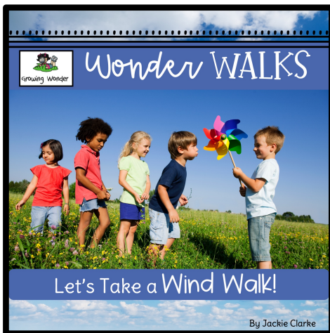
Let's Take a Wind Walk