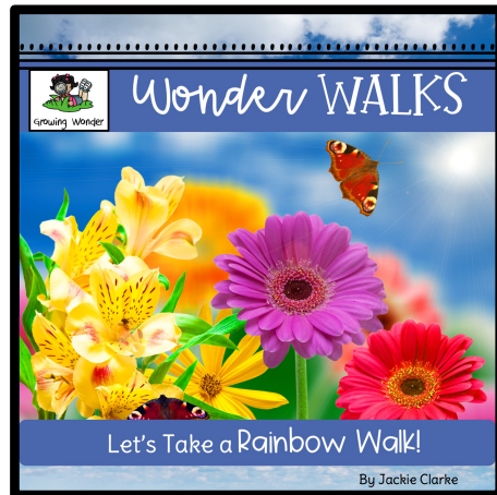
Let's Take a Rainbow Walk