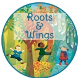
Roots & Wings