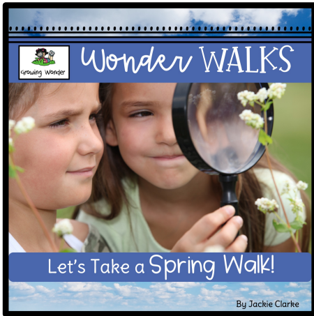
Let's Take a Spring Walk